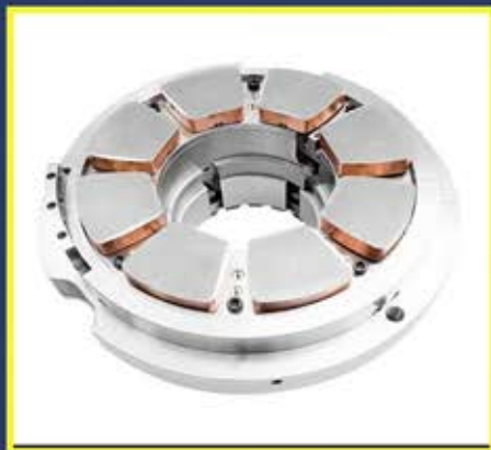
HYDROSTATIC & HYDRODYNAMIC BEARING