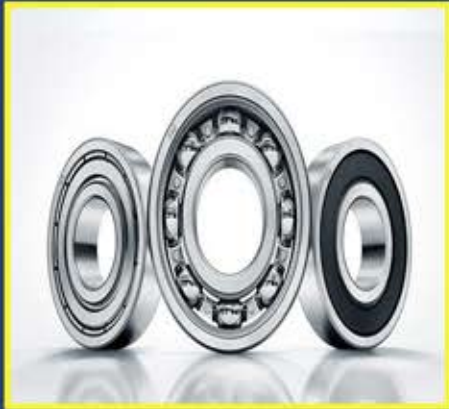
DEEP GROOVE BALL BEARING