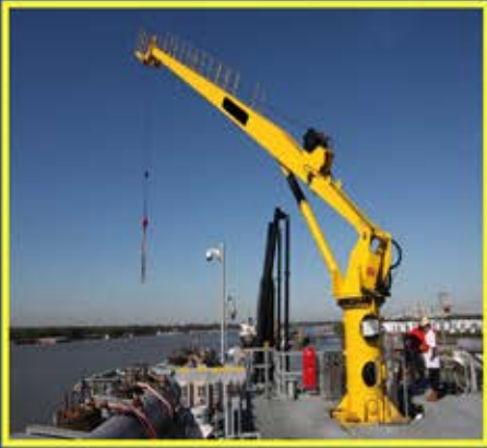
DECK EQUIPMENT & CRANES