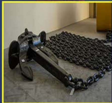
ANCHOR & ANCHOR CHAINS