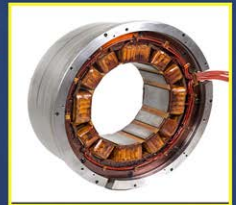
MAGNETIC BEARING ETC...