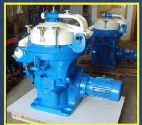
OIL PURIFIERS/ PARTS