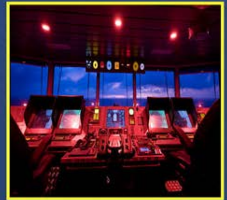
NAVIGATION & AUTOMATION SYSTEM