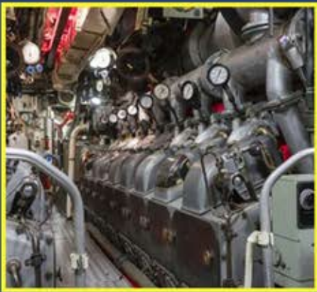
ENGINES & SPARES PARTS

WITH THE BROADEST PRODUCT OFFERING, MARUTI MARINE SUPPLIES: