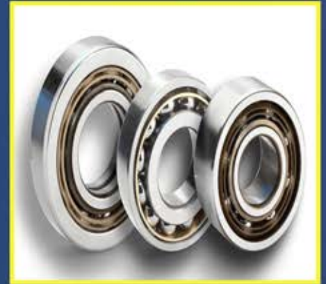
ANGULAR CONTACT BALL BEARING