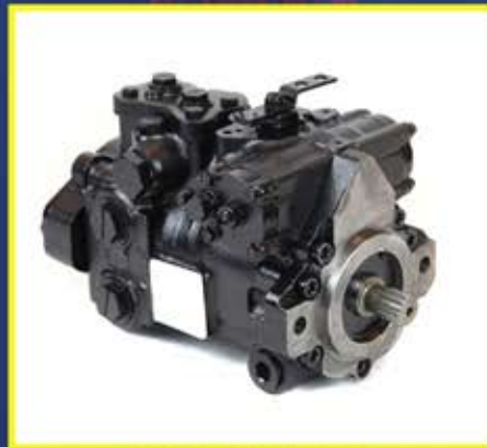
HYDRAULIC MOTORS & PUMPS