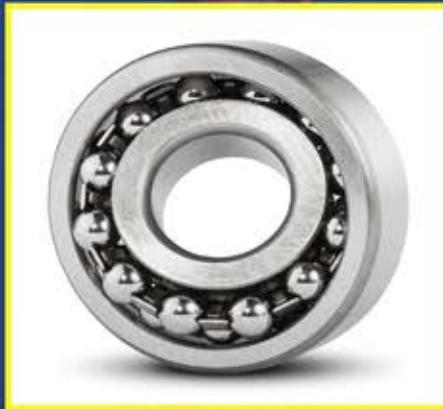
SELF-ALIGNING BALL BEARING