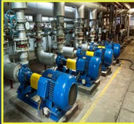
OIL & WATER PUMPS