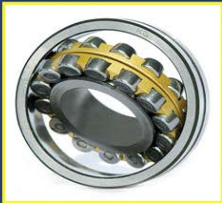
SPHERICAL ROLLER BEARING