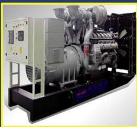
DIESEL GENERATOR SETS