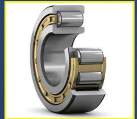
CYLINDRICAL ROLLER BEARING