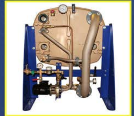
FRESH WATER GENERATORS