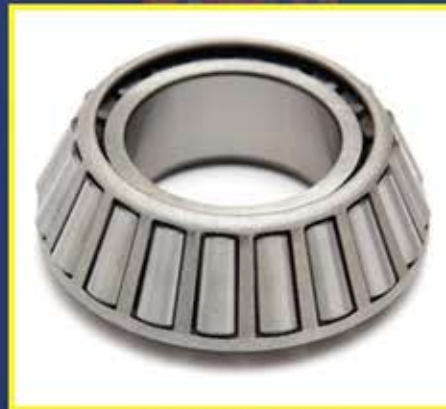
TAPERED ROLLER BEARING